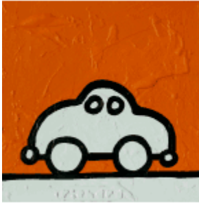
Daddy's Orange Car • 50 x 50cm