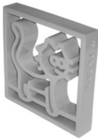
My Cat Series Cat Standing