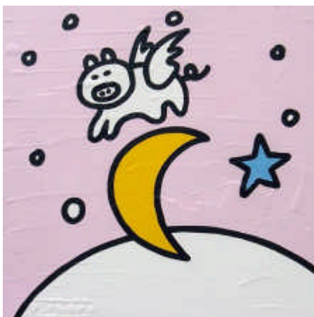
As the pig jumped over the moon 75cm X 75cm Impasto & acrylic on canvas 2003