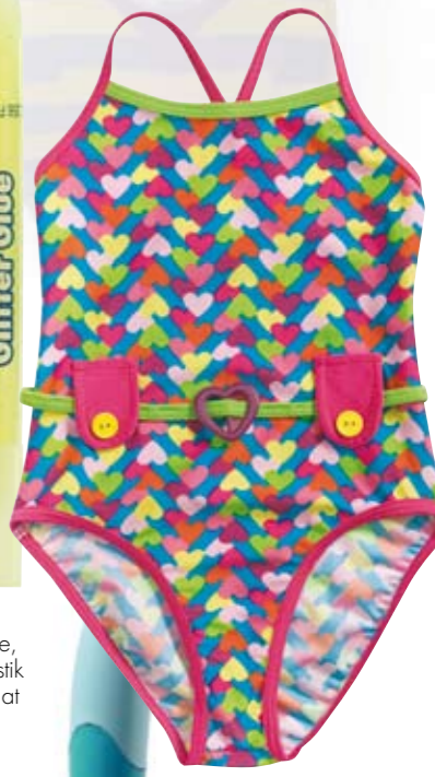
One piece, R69 , Woolworths