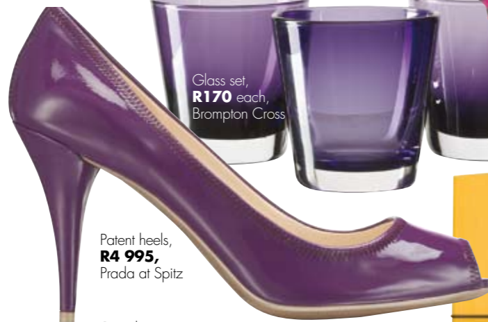
Patent heels, R4 995 , Prada at Spitz