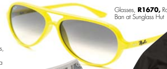
Glasses, R1670 , Ray Ban at Sunglass Hut