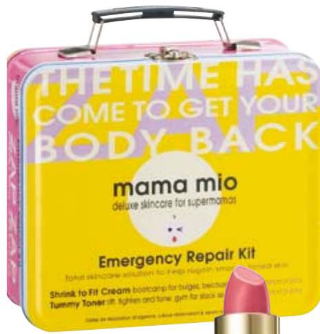
Mamma Mio emergency repair kit, R1 500 , www.maternalbliss.co.za