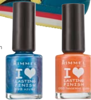
Azure nail varnish, R42 , Rimmel available from selected Clicks and Dischem stores, tangerine queen nail varnish, R42 , Rimmel available from selected Clicks and Dischem stores