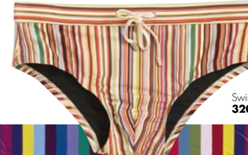
Swim briefs, R1 320 , Paul Smith