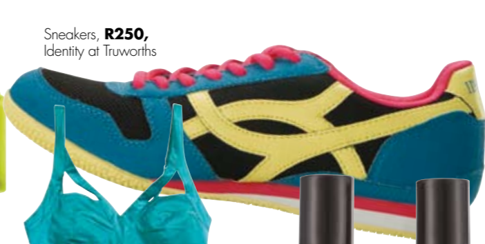
Sneakers, R250 , Identity at Truworths