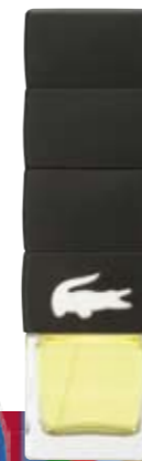
Lacoste Challenge eau de toilette, R1 167 , available at Stuttards stores nationwide