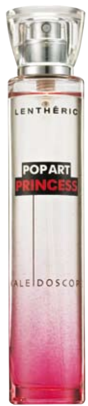
Pop Art Princess perfume, R199 , Lenthéric available from selected retail