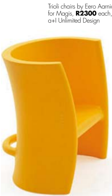
Trioli chairs by Eero Aarnio for Magis, R2300 each, a+I Unlimited Design