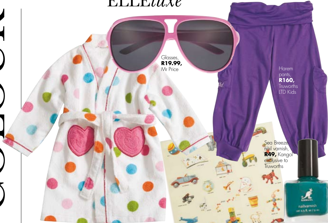
Glasses, R19.99 , Mr Price