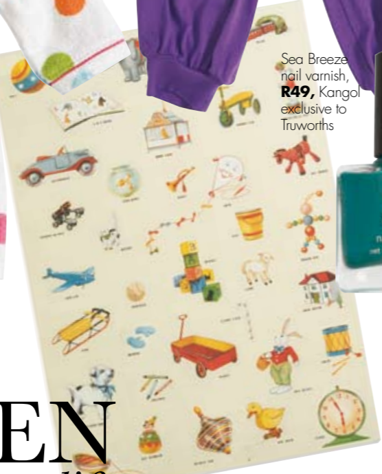
Learning board, R600 , Rhubarb Room