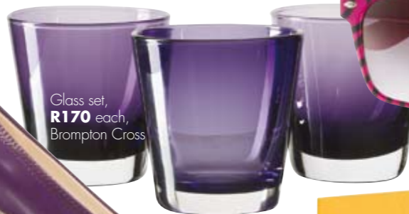
Glass set, R170 each, Brompton Cross