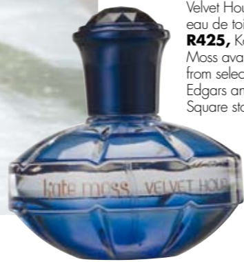
Velvet Hour eau de toilette, R425 , Kate Moss available from selected Edgars and Red Square stores