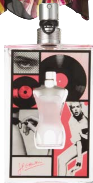
Jean Paul Gaultier Rose n Roll eau de toilette natural spray, R1030 , available at Stuttafords stores nationwide