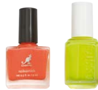
Funky Limelight Nail varnish, R89 , Essie available from selected Dischem stores, Shanghai Sunrise nail varnish, R49 , Kangol exclusive to Truworths stores