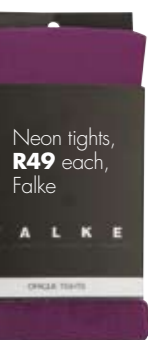
Neon tights, R49 each, Falke