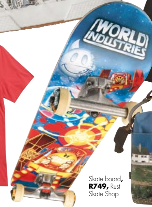
Skate board, R749 , Rust Skate Shop