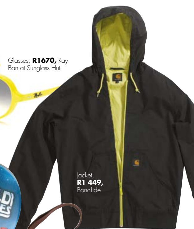
Jacket, R1 449 , Bonafide