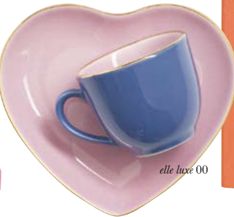
elle luxe 00