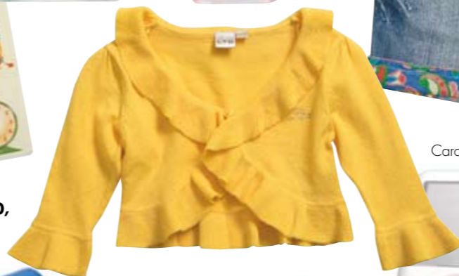
Cardigan, R150 , Truworths LTD Kids