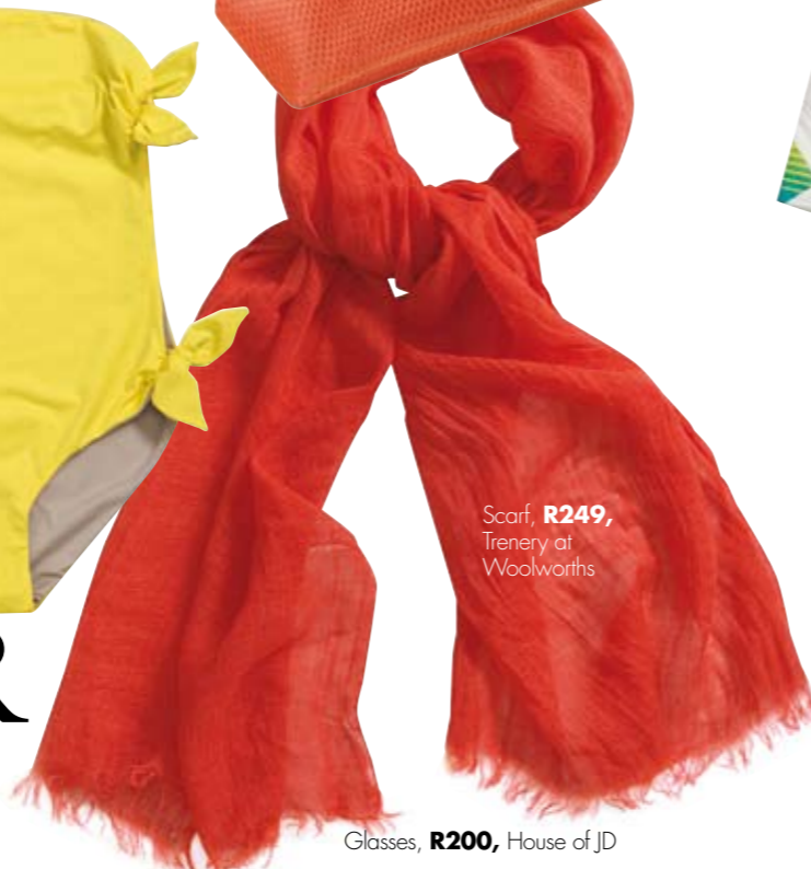
Scarf, R249 , Trenery at Woolworths