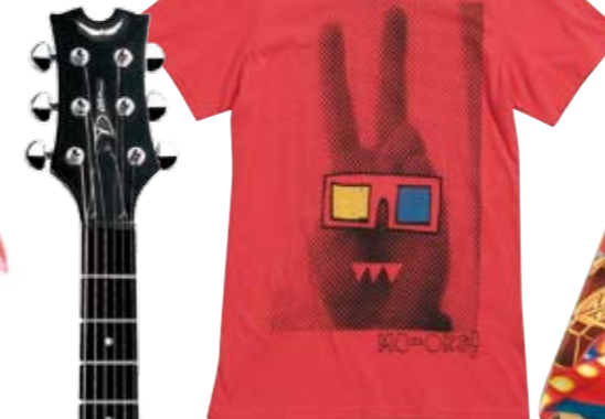
Retro tee, R340 , Bonafide