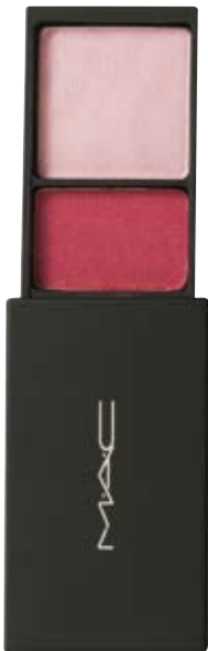
Rose sweets eyeshadow, R145 , MAC, exclusive to MAC stores