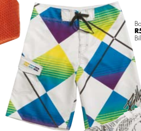
Board shorts, R599 , Billabong