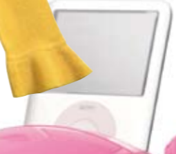
Piggy ipod station, R195 , Game