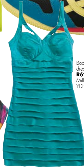
Body con dress, R625 , Milla at YDE